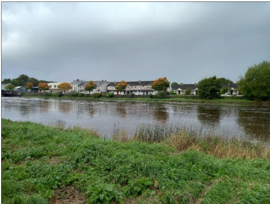
Plate 18-4 View towards existing flood walling along Bachelor's Walk and mid-twentieth century housing fronting along same (from Clare Street – Howley Street)