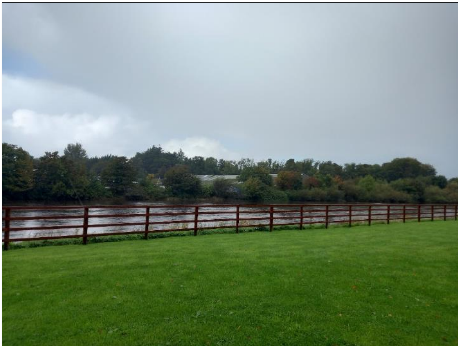
Plate 18-6 View towards temporary works area at former Ballina Dairy/Co-Op north of Bachelor's Walk