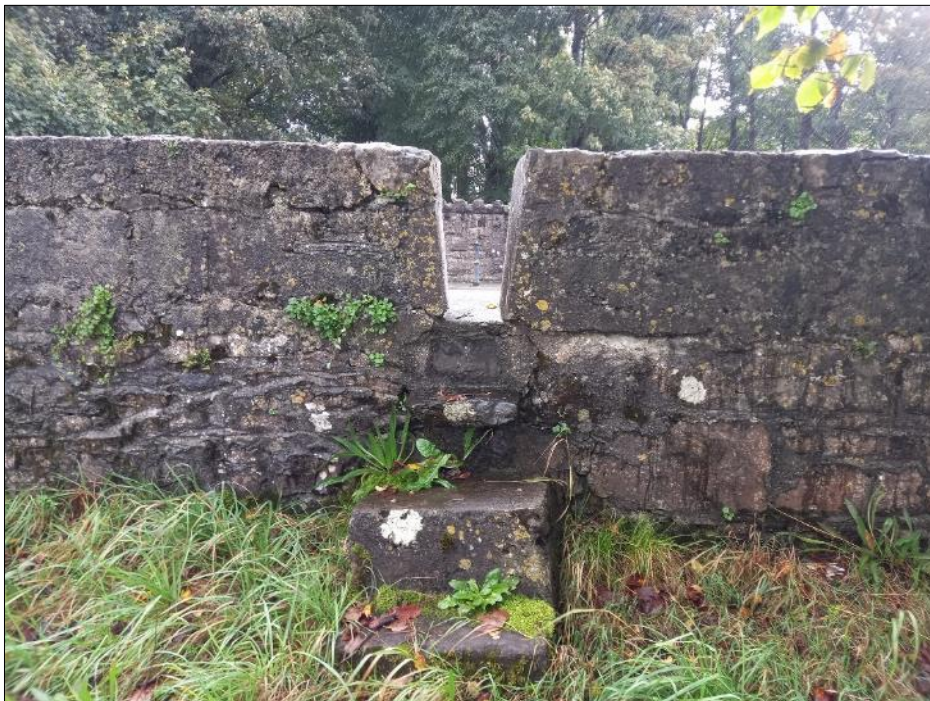
Plate 18-14 View from riverbank of roadside access to pier CH03 along flood walling at Clare Street (Howley Street)