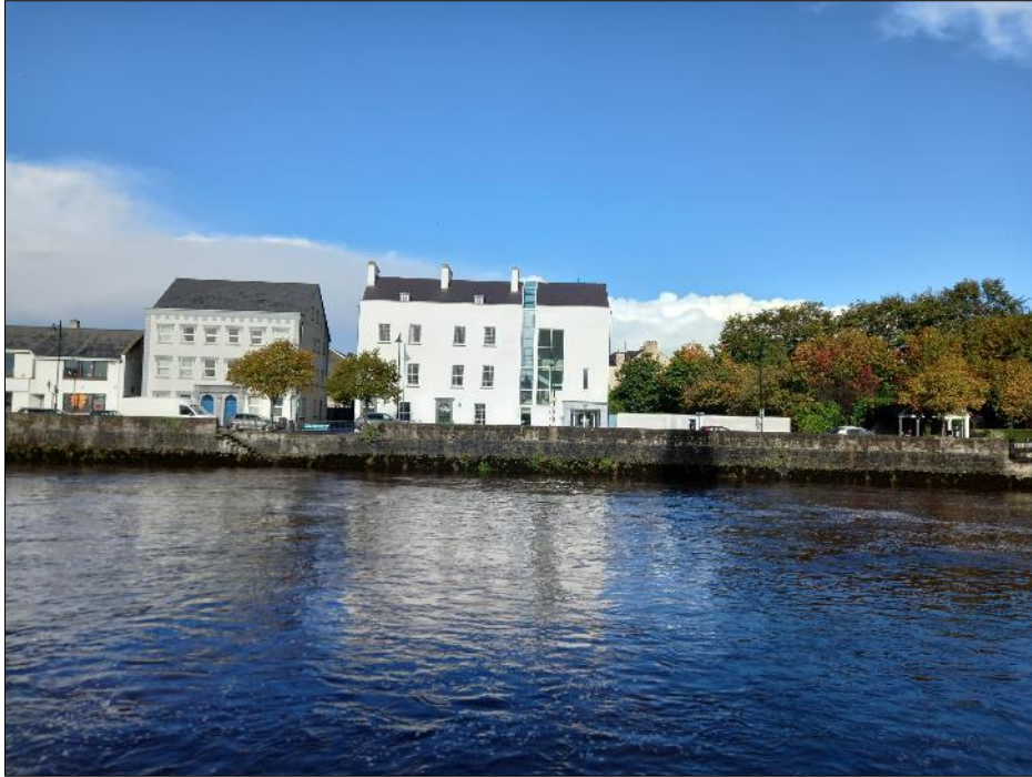
Plate 18-39 View towards recently renovated pair of semi-detached townhouses (Mary Robinson birthplace) and Emmet Street quayside