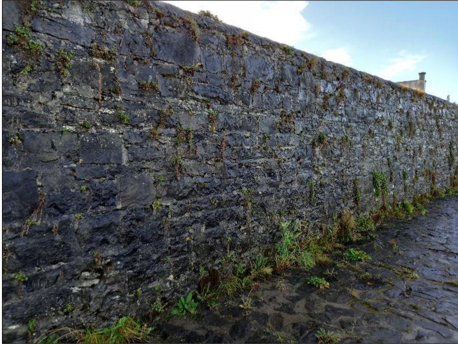
Plate 18-21 View of riverside elevation of flood walling and stone paved platform/quayside adjacent Upper Bridge along Cathedral Road. Note considerable wall height