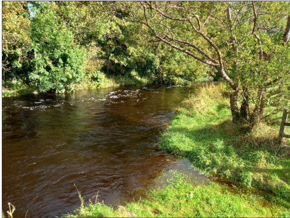
Plate 18-59 View upstream along Brusna riverbanks adjacent to R294