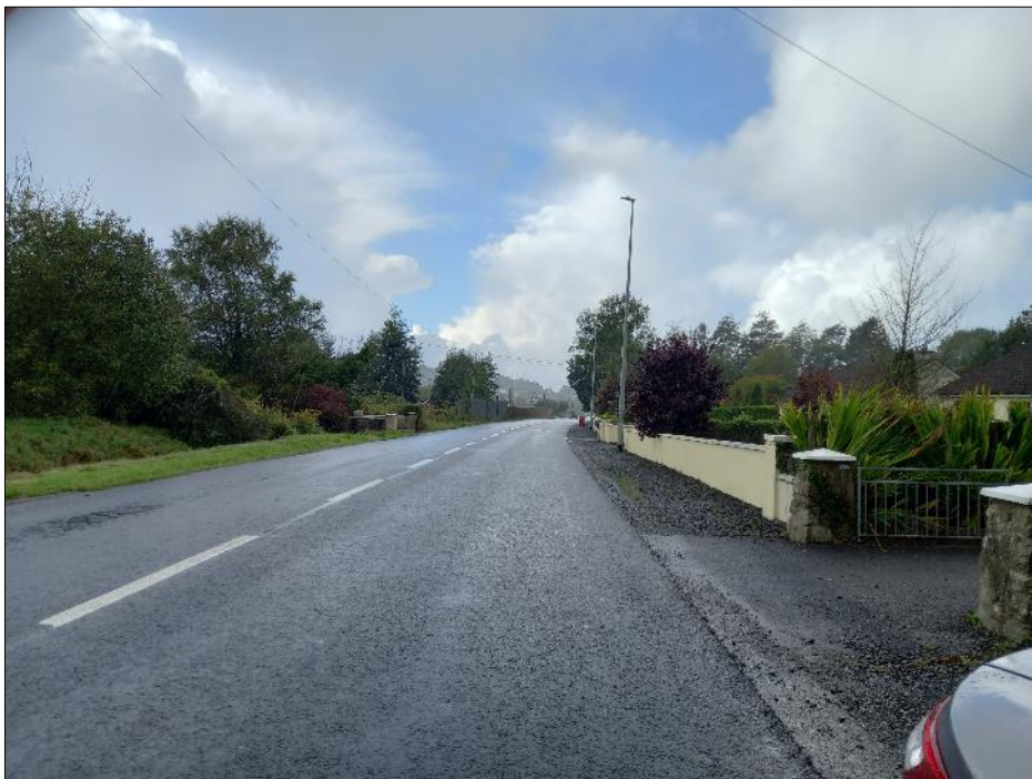
Plate 18-70 View east along Behy Road