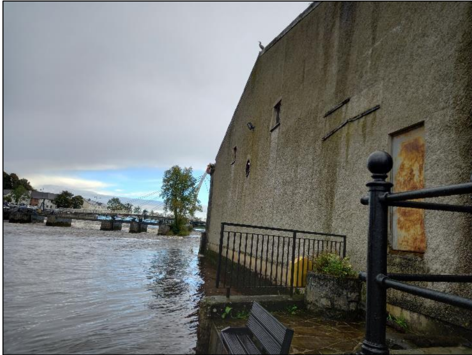
Plate 18-53 View towards south and terminus area to rear of Ballina Manor Hotel