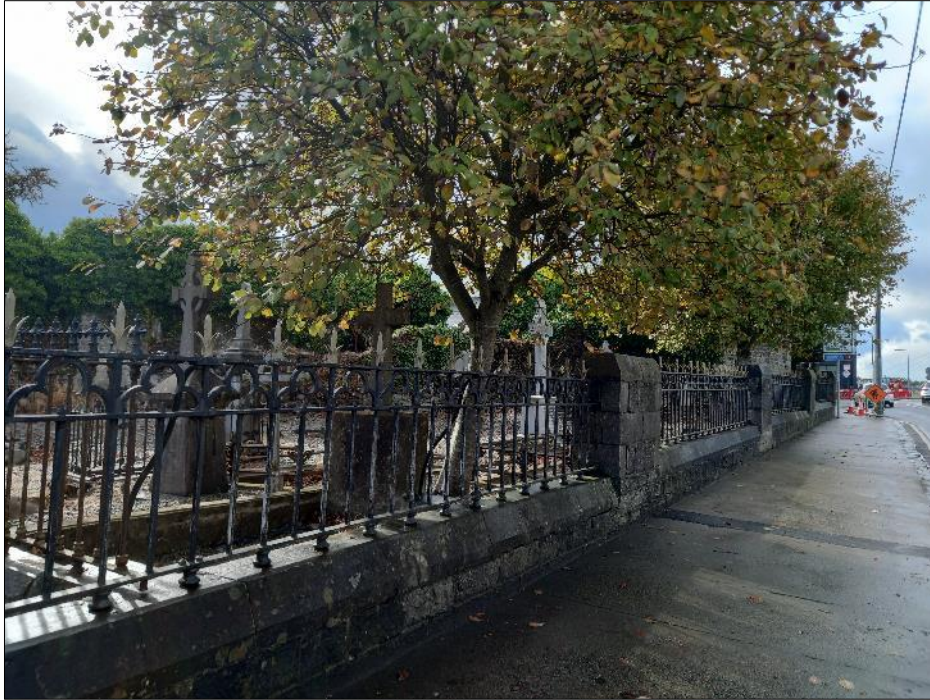
Plate 18-31 View of railings of St Muredach's Cathedral (RPS 30) along Cathedral Road