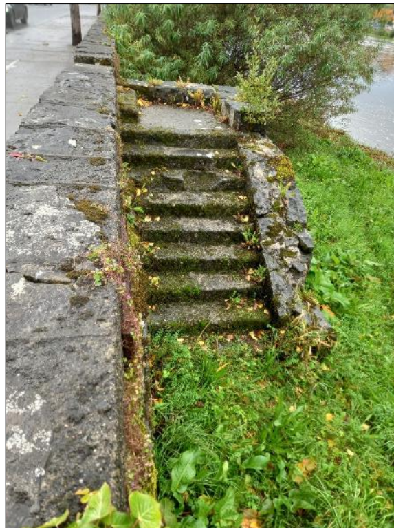
Plate 18-12 View of riverbank/fishing access CH02 along flood walling at Clare Street (Howley Street)