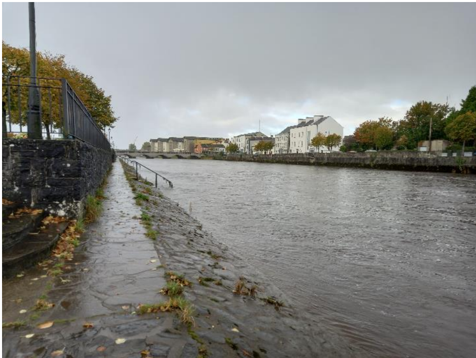
Plate 18-26 View towards Upper Bridge of riverside access footpath/platform