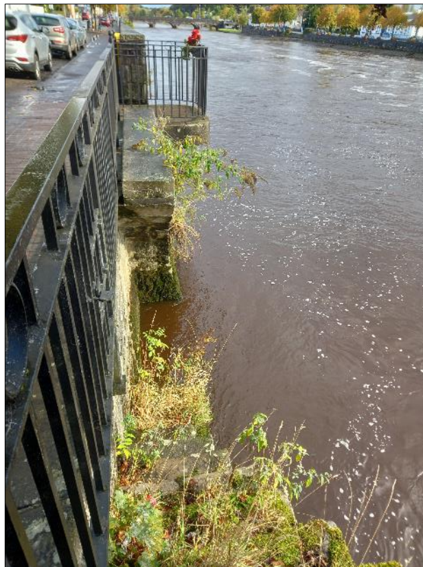
Plate 18-38 View of river access steps and mooring point along quayside at Emmet Street