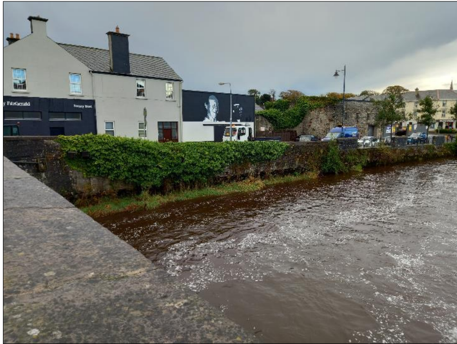
Plate 18-41 View of vegetated abutting flood walling to Upper Bridge southern wing wall at Ridgepool Road