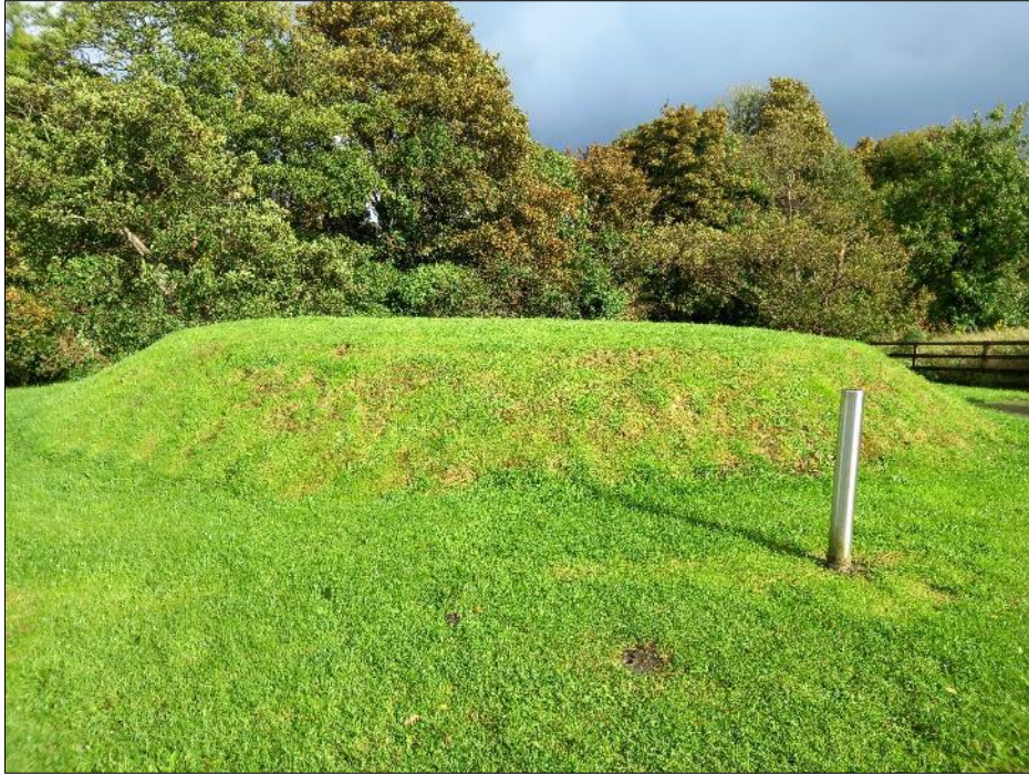
Plate 18-61 Replica ringfort community installation at Rathkip along the R294