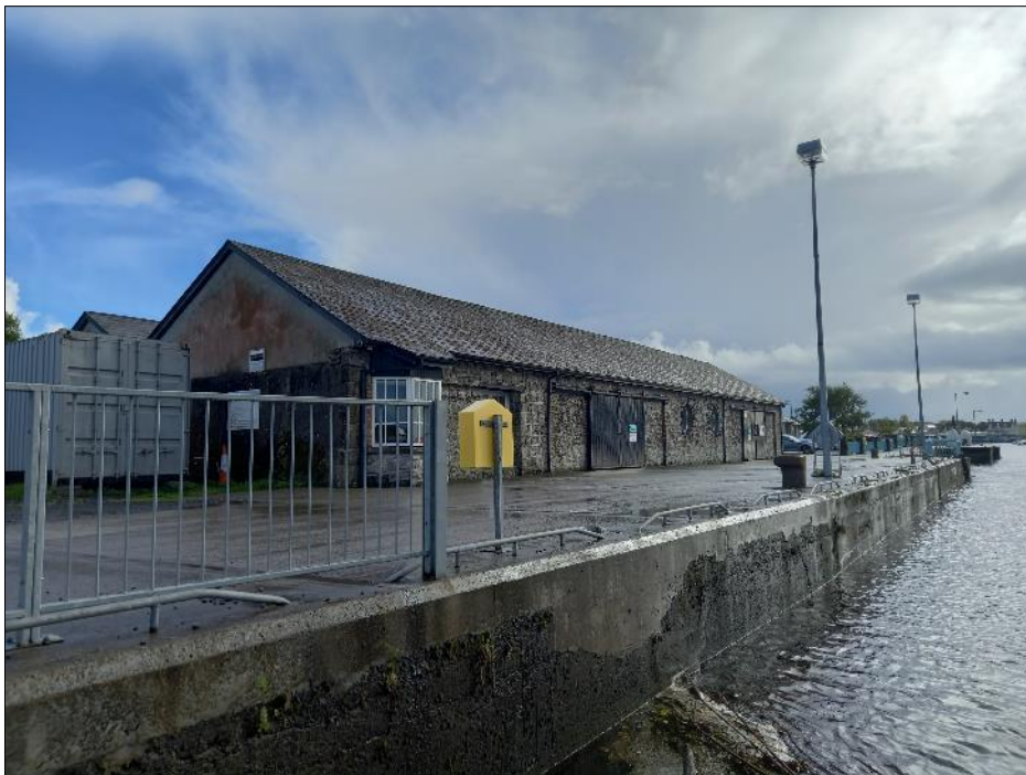
Plate 18-74 View of Crocketts Quay (ACA) area, River Moy (Quignamanger enviorns)