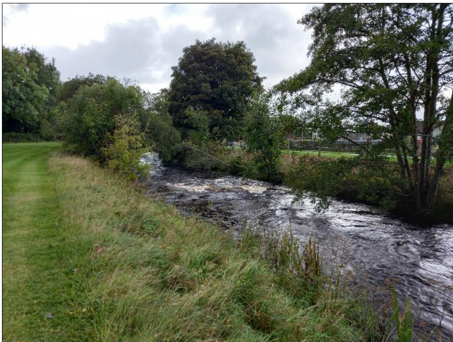
Plate 18-58 View along Brusna riverbank adjacent to access bridge to Shanaghy Heights