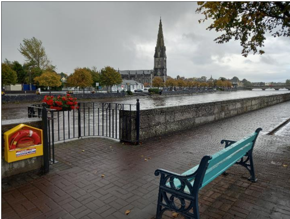
Plate 18-40 View from Emmet Street quayside towards opposite riverbank and St Muredach's Cathedral