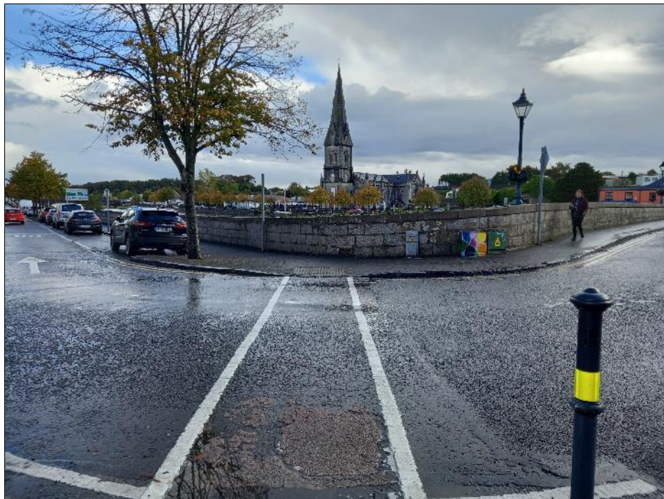
Plate 18-34 View towards junction of Emmet Street with Upper Bridge. Note no change in masonry style from wing wall to quay wall