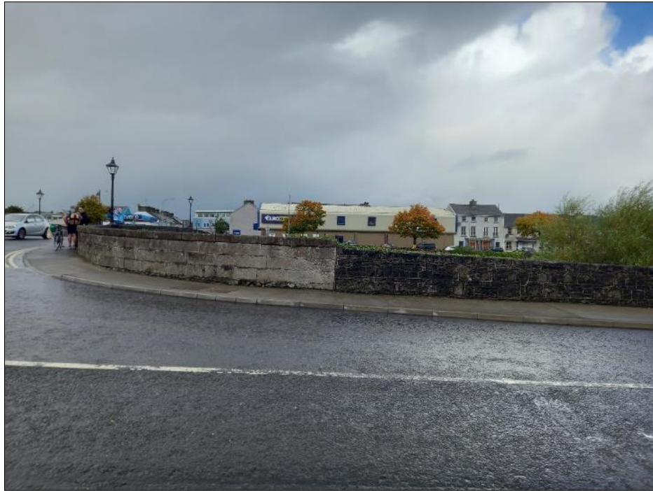
Plate 18-9 Wing wall of Lower Bridge and tie-in with existing flood walling along Clare Street (Howley Street)