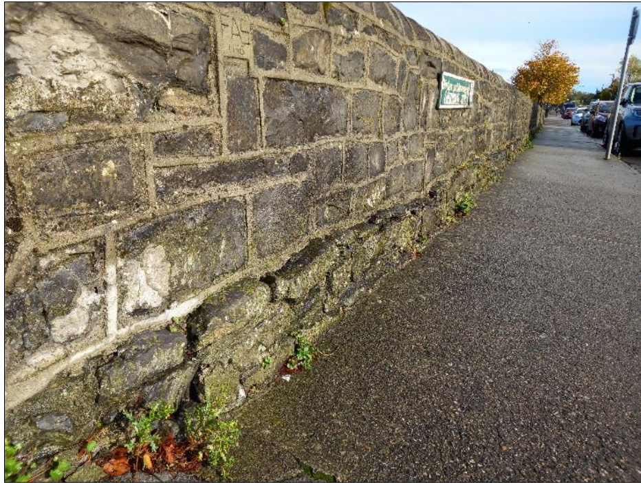
Plate 18-19 View of roadside flood walling elevation adjacent Upper Bridge along Cathedral Road. Note protruding lower courses and later repointing with 'FAS 1996' inscription