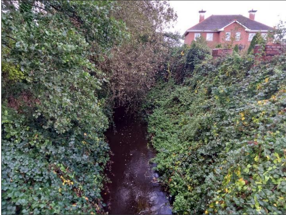
Plate 18-67 View towards west from N26 Rahans Bridge of heavily vegetated stream banks to Tullyegan stream