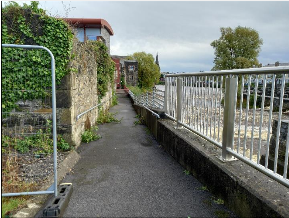
Plate 18-55 View towards rear area of Ballina Arts Centre. Note that riverside access to the former warehouse(s) fronting the river was not possible during field survey