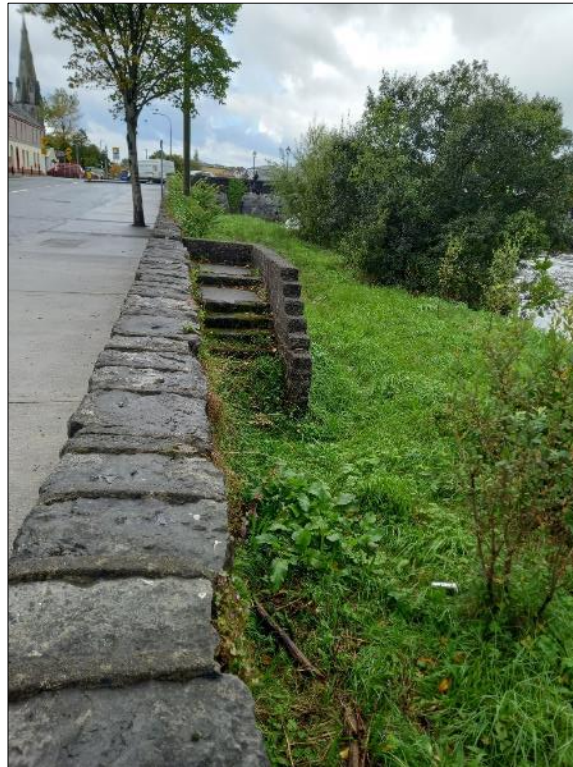
Plate 18-11 View of (modified) riverbank/fishing access CH01 along flood walling at Clare Street (Howley Street)