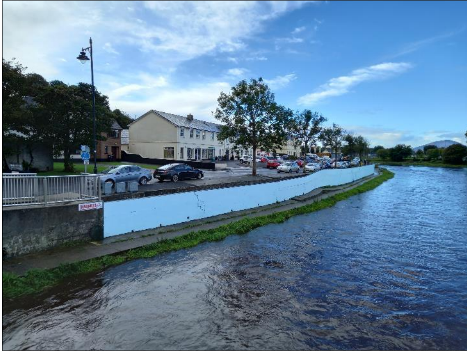
Plate 18-49 View towards riverside wall elevation (rendered and painted) upstream from pedestrian bridge, along Ridgpool Road