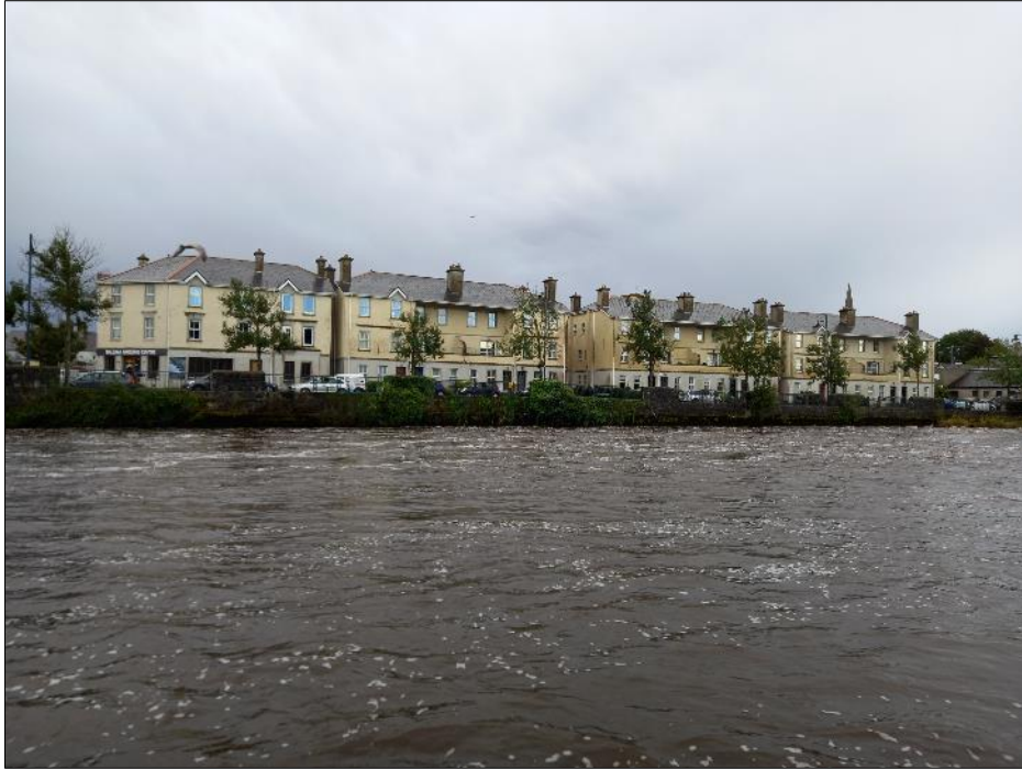
Plate 18-43 View from Upper Bridge of stop-start upstanding flood walling with interspersed modern railings along Ridgepool Road