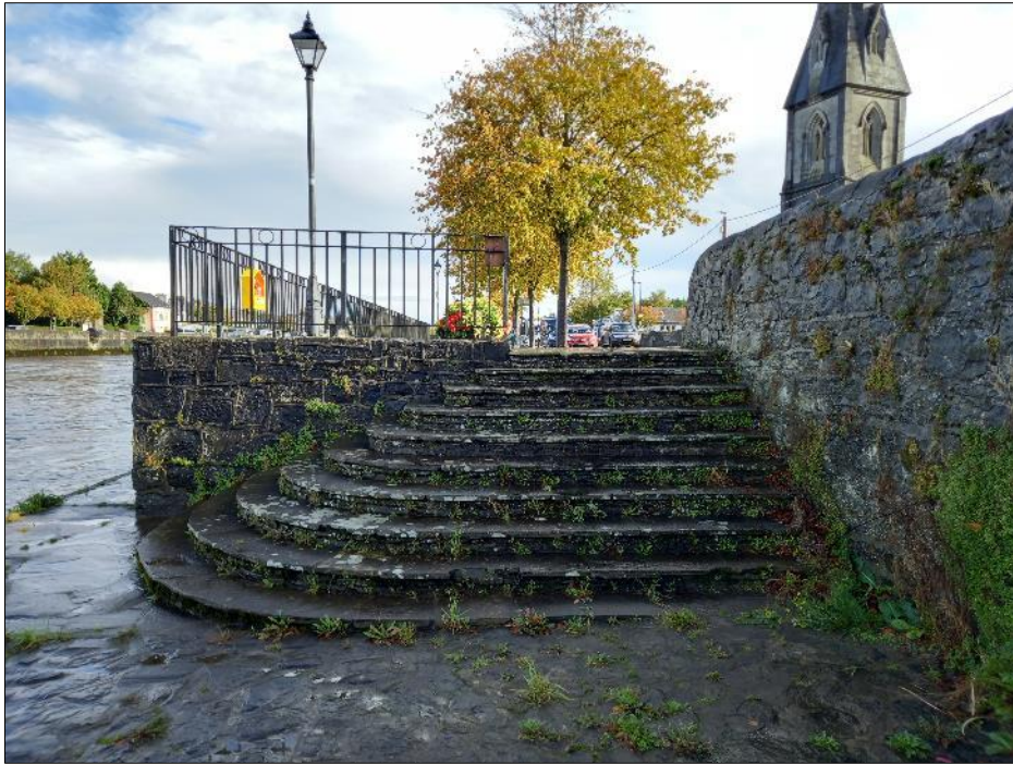
Plate 18-23 View of stone access steps to riverside quay area near Upper Bridge, Cathedral Road