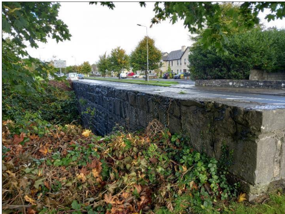
Plate 18-66 View toward Tullegan stream elevation of Rahans Bridge (N26)