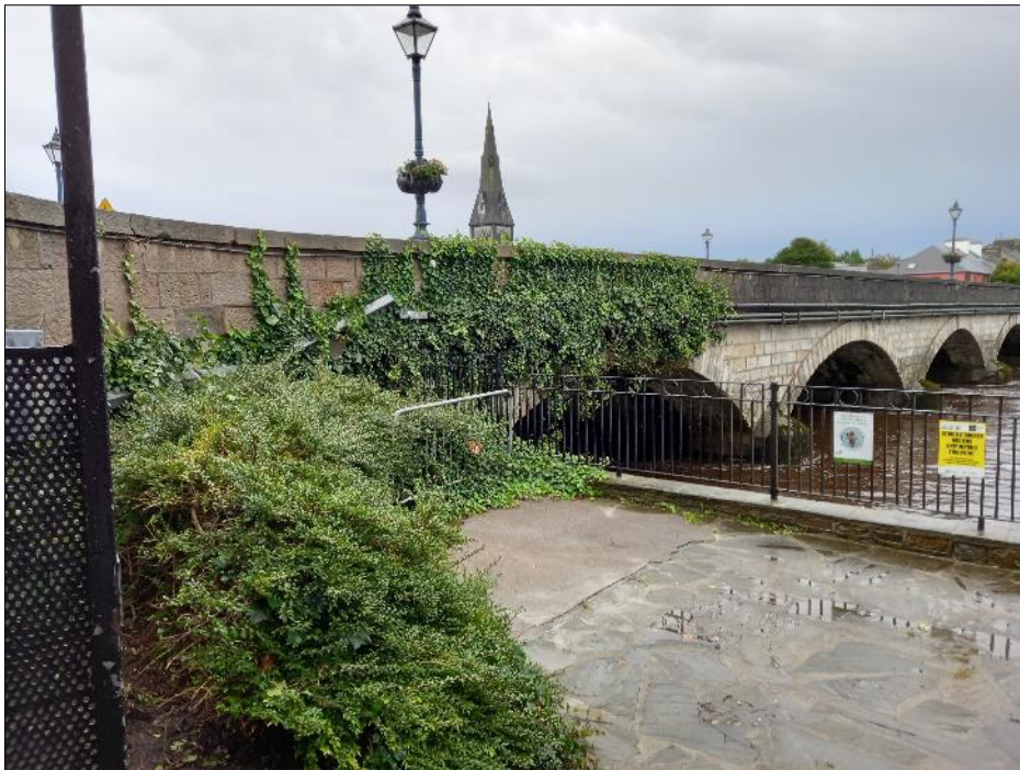
Plate 18-50 View of railing abutment to southern parapet of Upper Bridge to rear of Ballina Manor Hotel