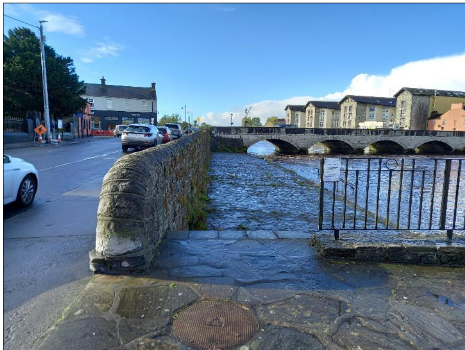
Plate 18-20 View of flood wall terminus, access steps and riverside stone paved platform/quayside (CH05) adjacent Upper Bridge along Cathedral Road.