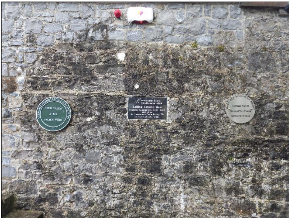
Plate 18-46 External wall elevation to Salmon Weir building, restored 2011