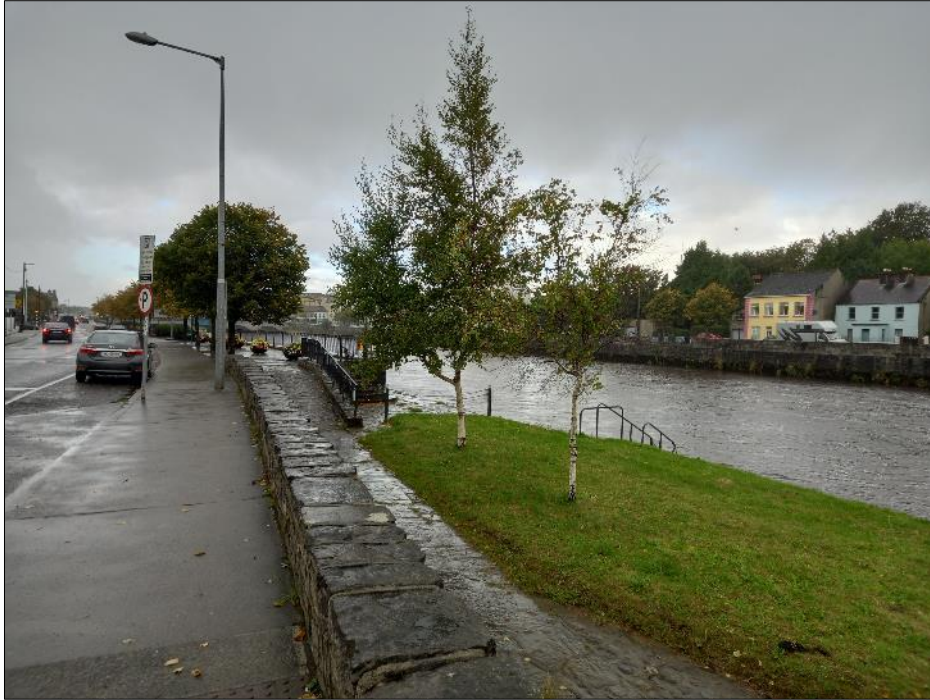
Plate 18-25 View along flood walling and riverside access from Lower Bridge area, Cathedral Road