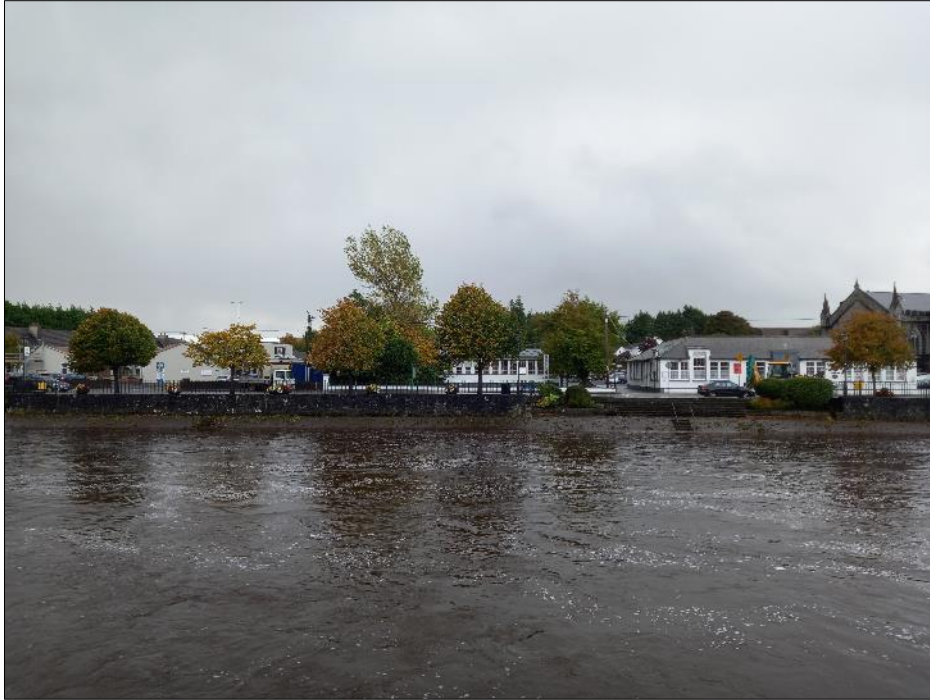
Plate 18-27 View towards Cathedral Road existing flood walling and public riverside access from Emmet Street