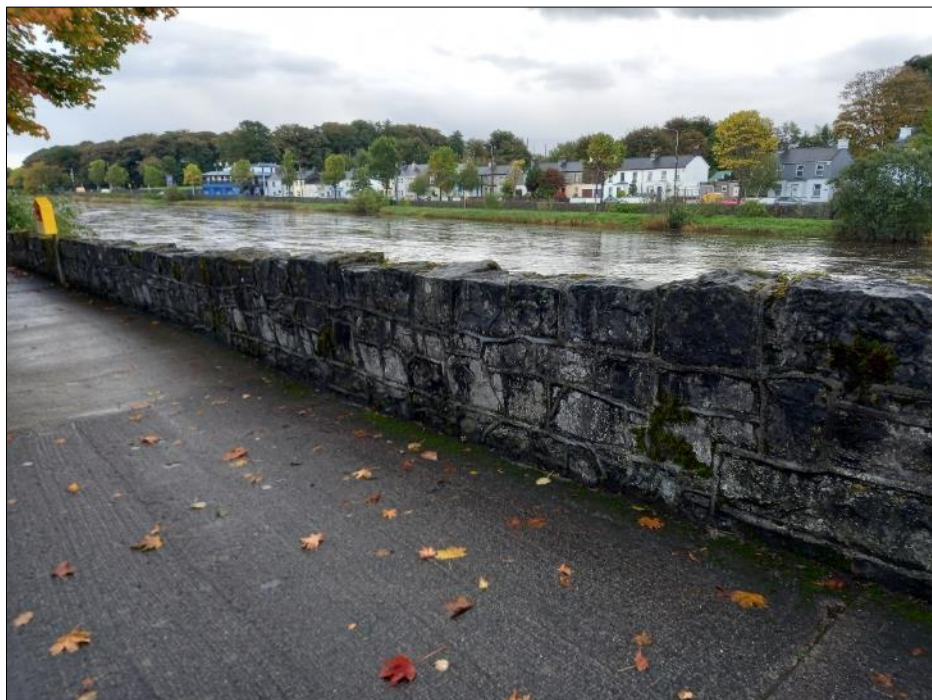
Plate 18-2 View of existing flood wall elevation along Bachelor's Walk