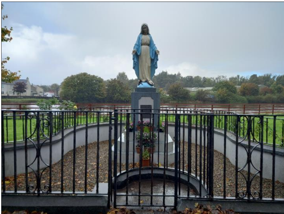
Plate 18-16 View of Marian Shrine (1954) CH04 along riverbank at Clare Street (Howley Street)