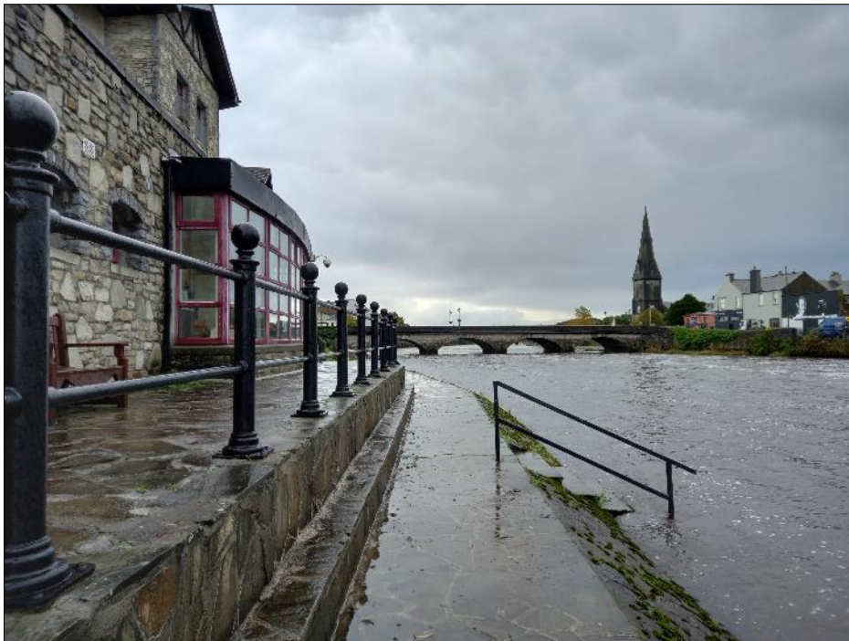
Plate 18-52 View along riverfront at rear of Ballina Manor Hotel. Note modern stepped platform, railings and stepped angling river access