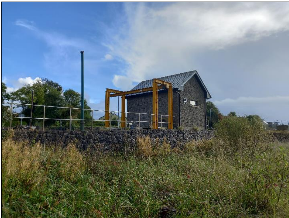
Plate 18-72 View towards west elevation Moy Boat Club building (modern) at Creggs Road/Quay Rad junction