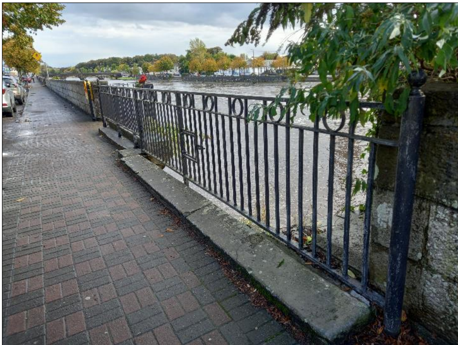
Plate 18-36 View along quayside at Emmet Street towards Lower Bridge with modern railing inserts