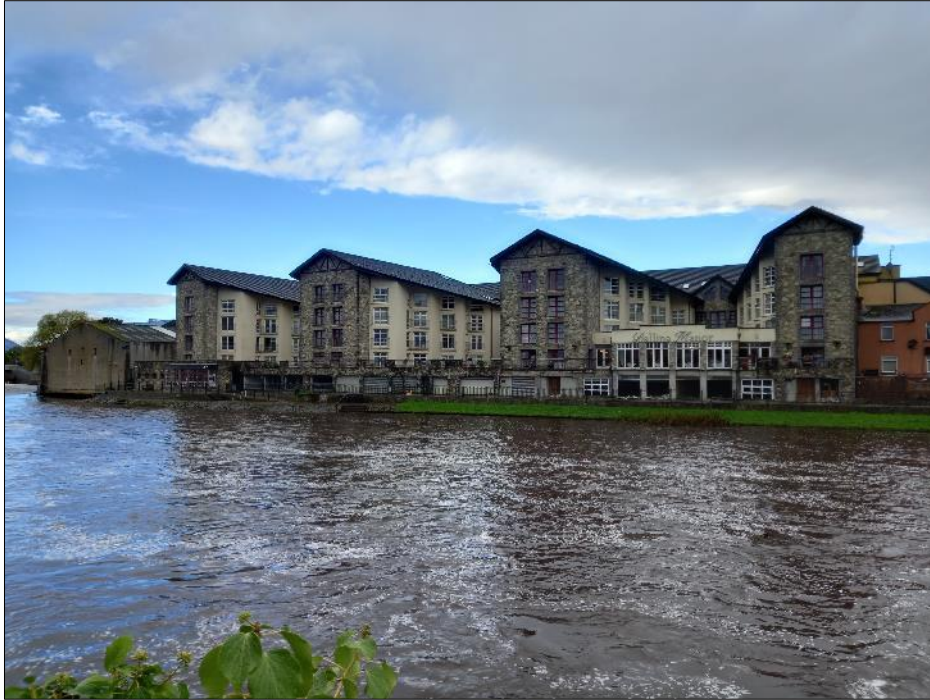
Plate 18-57 View towards river frontage area to rear of Ballina Manor Hotel requiring replacement glass walling in combination with replacement flood walling