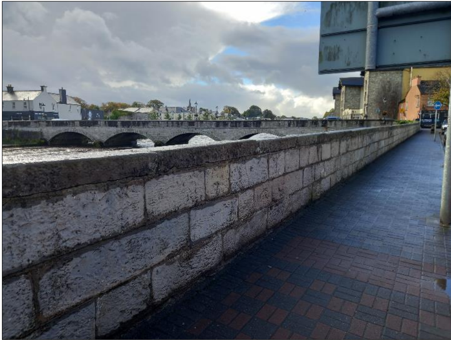
Plate 18-35 View along quayside walling at Emmet Street, towards Upper Bridge