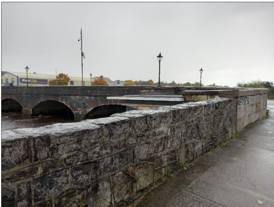
Plate 18-24 View of roadside elevation flood walling adjacent Lower Bridge, Cathedral Road