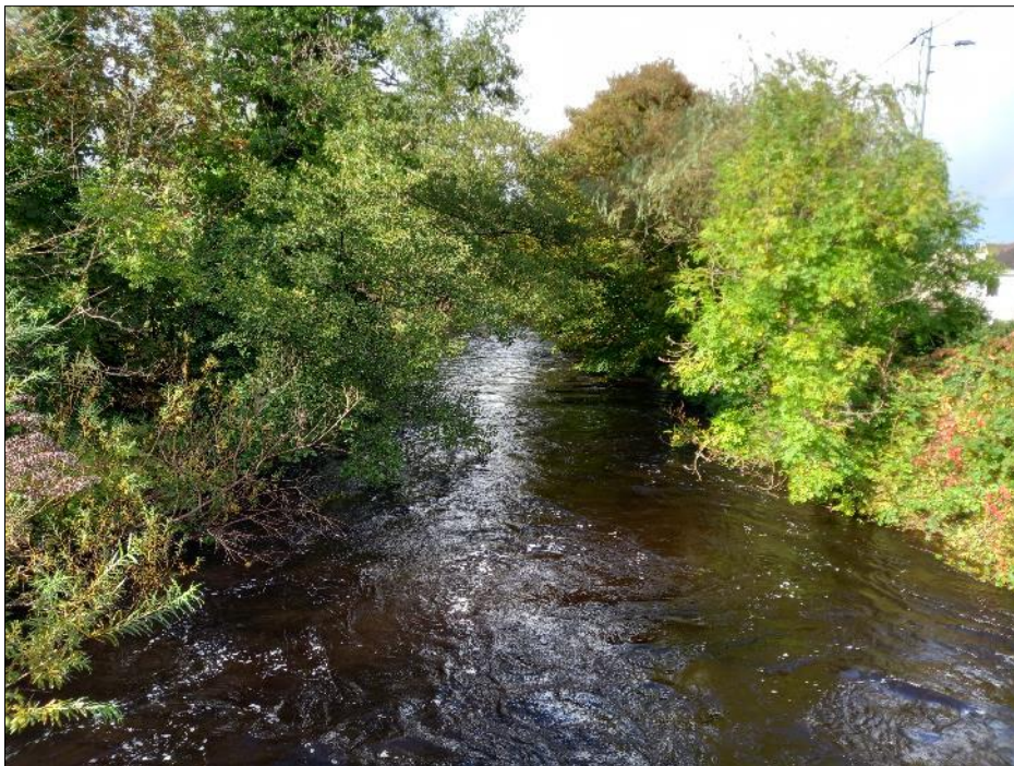
Plate 18-62 View downstream to River Brusna and works area riverbank (left) from Rathkip Bridge