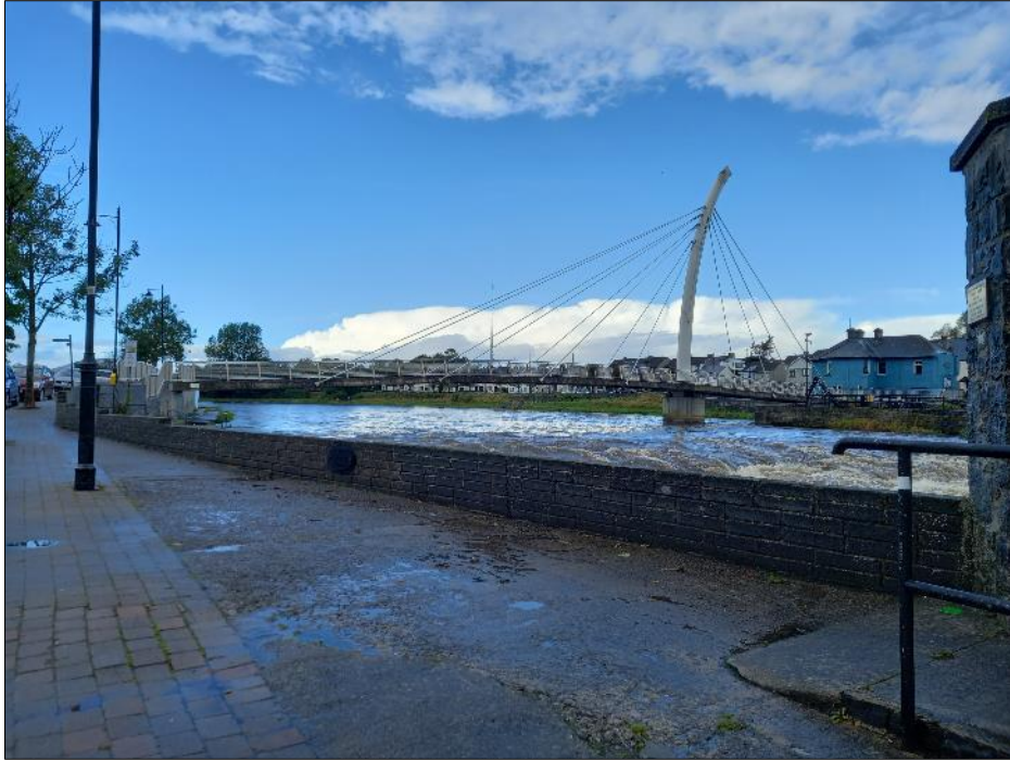
Plate 18-47 View towards cast concrete flood walling and pedestrian bridge