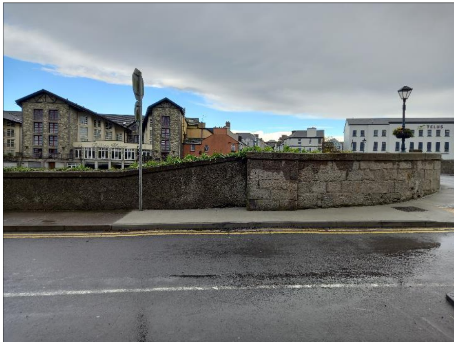
Plate 18-42 View of tie-in location of existing wall with Upper Bridge at Ridgepool Road. Note roughcast render