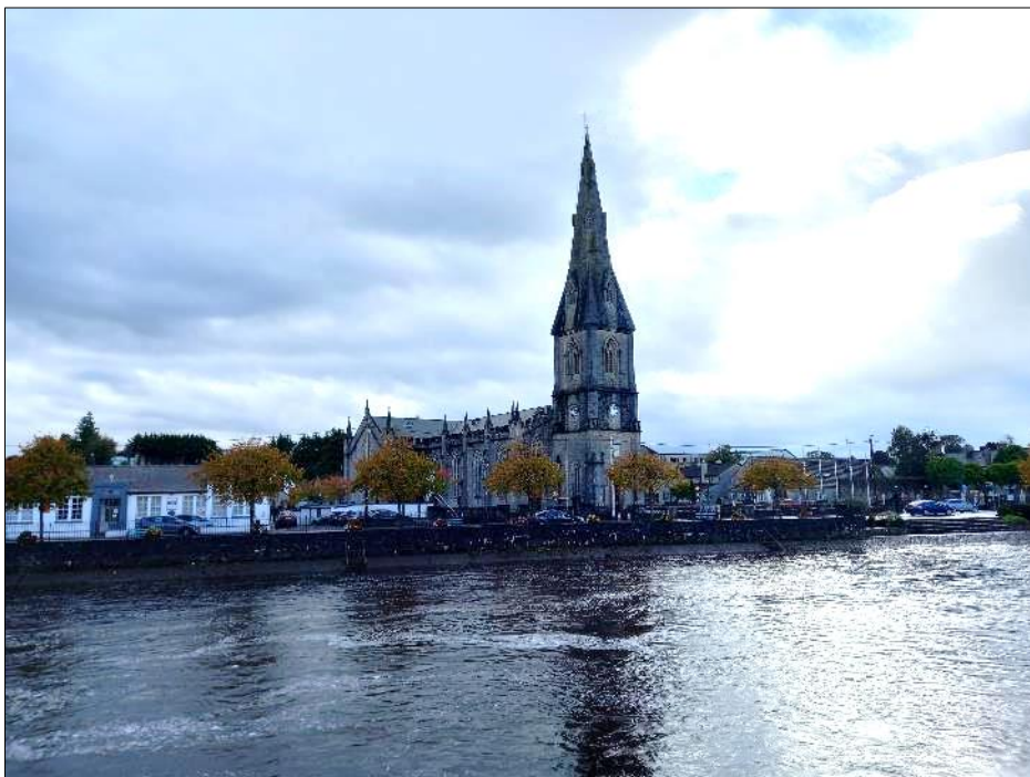
Plate 18-28 View towards Cathedral Road existing flood walling and St Muredach's Cathedral from Emmet Street