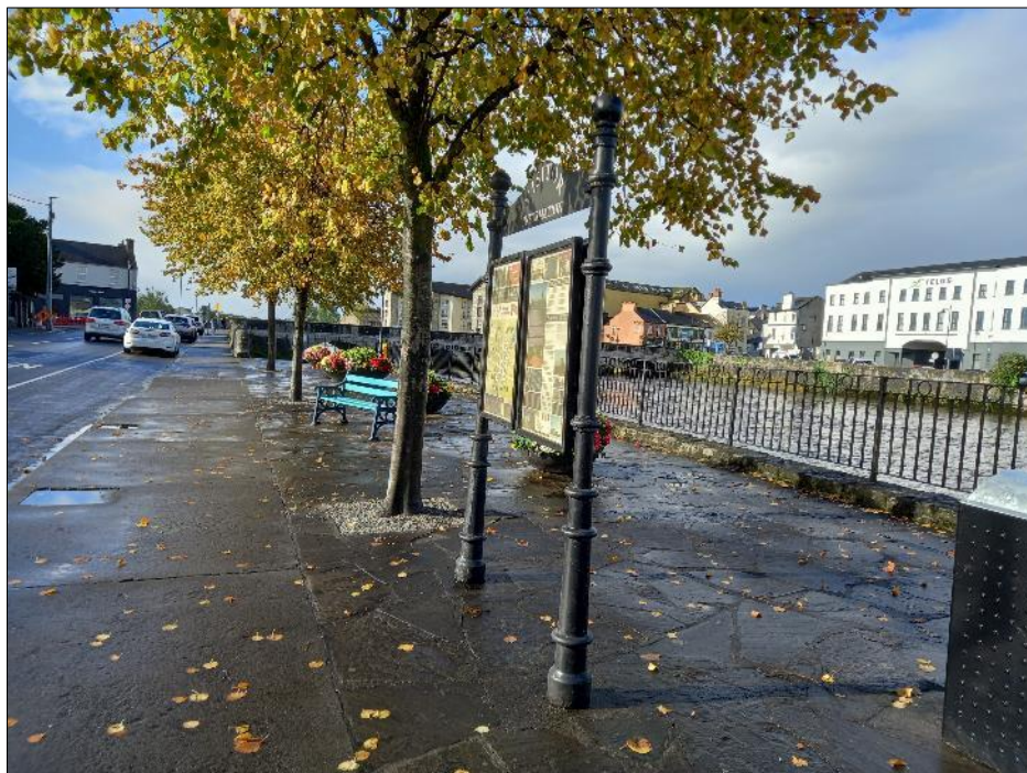
Plate 18-30 View towards existing public riverside amenity area and street furniture along Cathedral Road