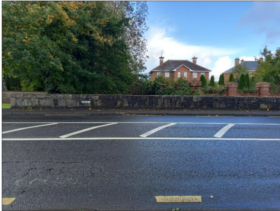
Plate 18-65 View of Rahans Bridge MA-N26-001.00 eastern parapet along N26