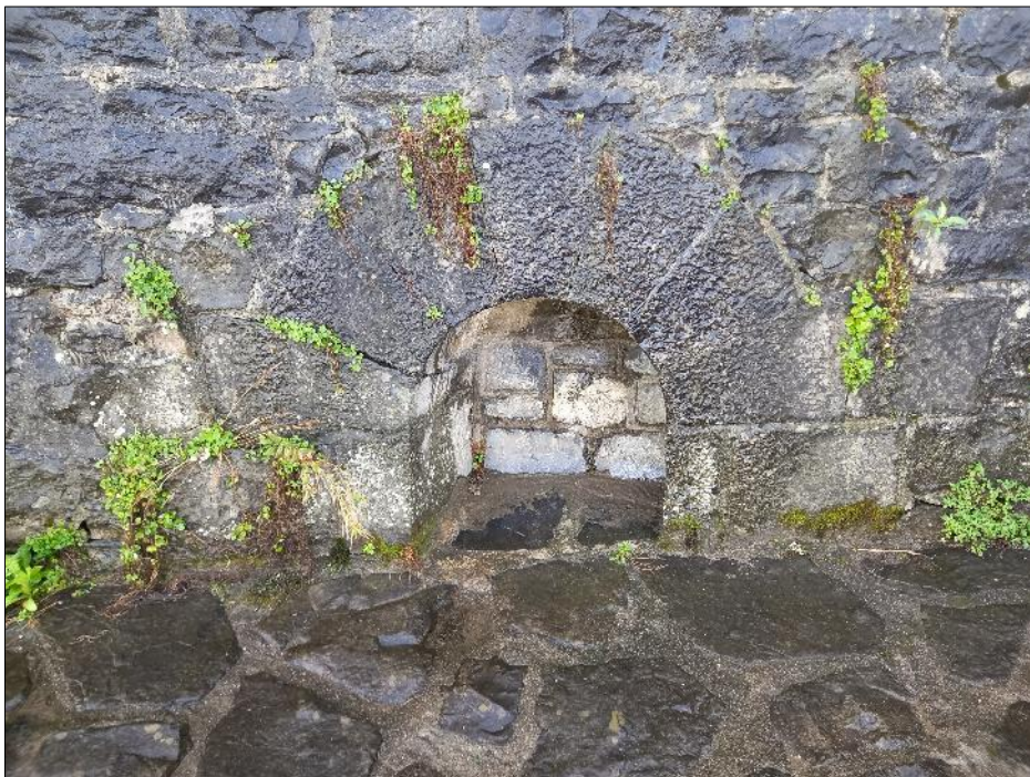
Plate 18-22 View of cut stone drainage feature along base of flood wall at riverside elevation adjacent Upper Bridge, Cathedral Road