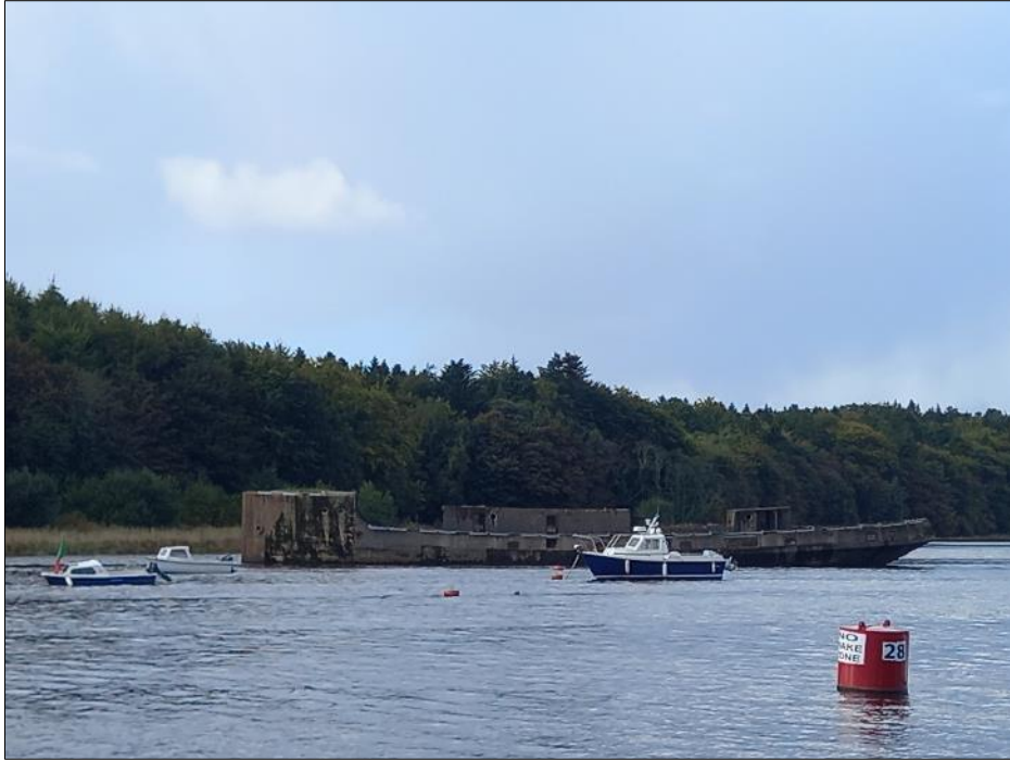
Plate 18-71 View towards Creteboom SS in River Moy from Moy Boat Club