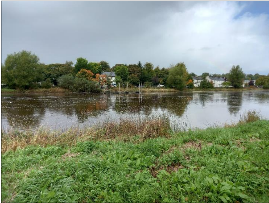
Plate 18-5 View towards floating jetty along northern area of Bachelor's Walk works location