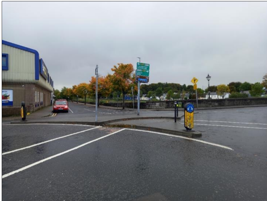
Plate 18-1 View towards junction of northern Lower Bridge elevation and tree-lined Bachelor's Walk area with commercial premises opposite