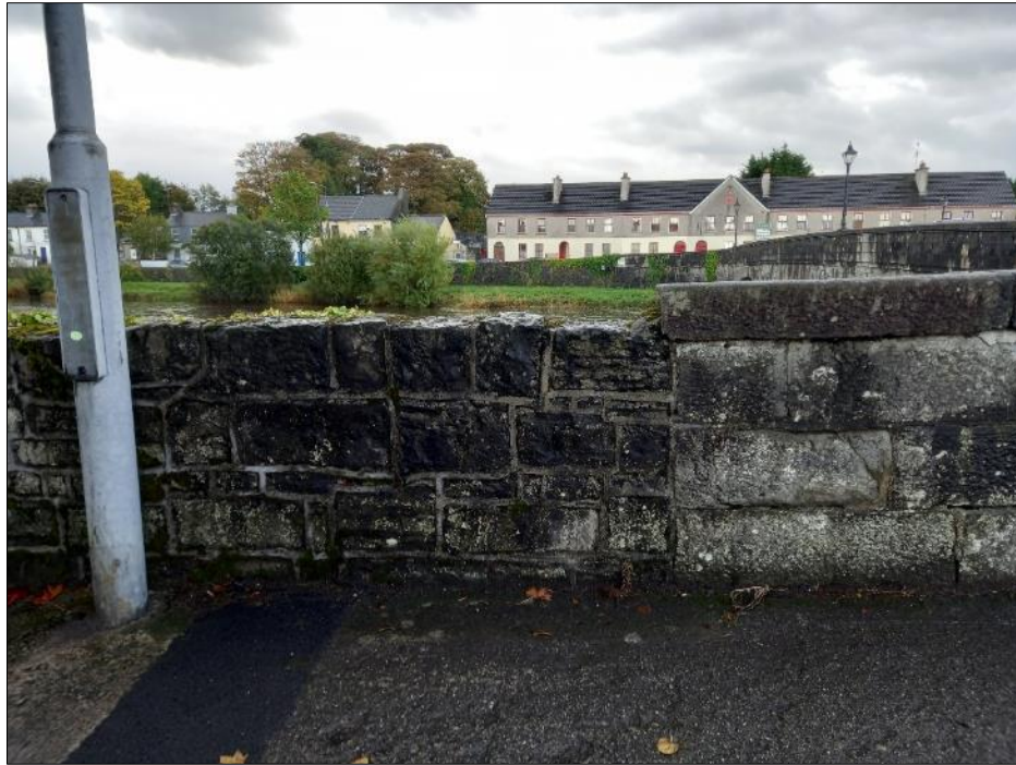
Plate 18-7 Lower Bridge wing wall (northern elevation) tie-in with existing flood relief walling (left)