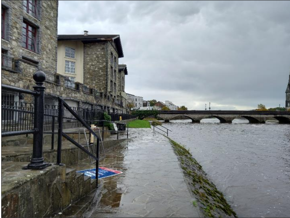
Plate 18-51 View along riverfront at rear of Ballina Manor Hotel. Note modernised surface treatment, modern railings and access ramps/steps