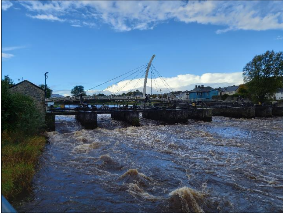
Plate 18-45 View towards Salmon Weir and adjacent weir building fronting Ridgpool Road