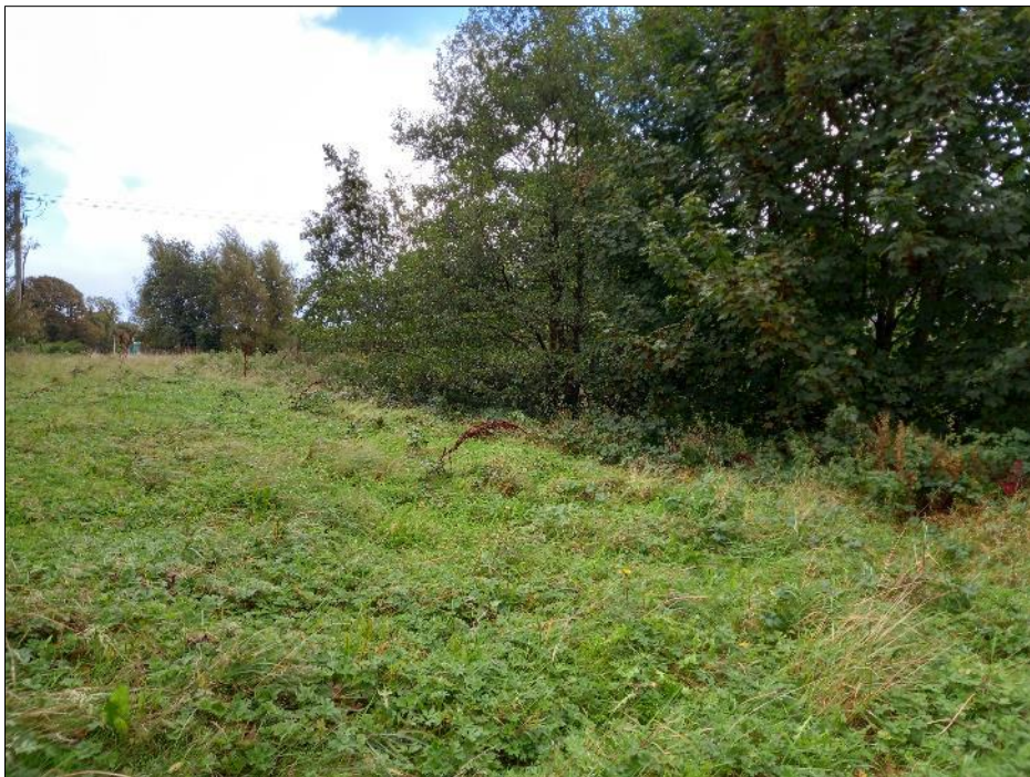
Plate 18-68 View towards culverted open channel area of Bunree stream, adjacent N59 at Moyvale Park