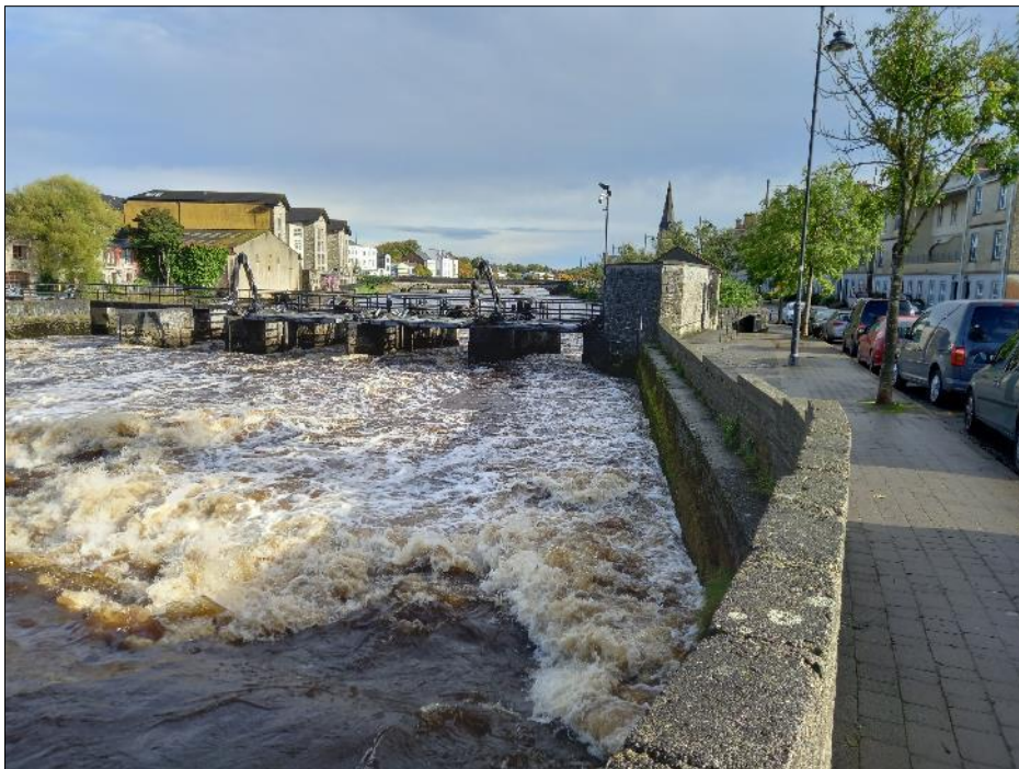
Plate 18-48 View towards cast concrete stepped riverside wall elevation along Ridgpool Road