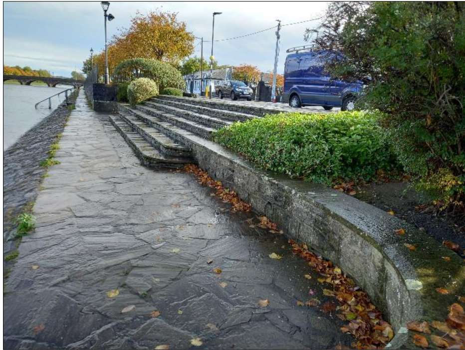
Plate 18-29 View towards public access to riverside along Cathedral Road