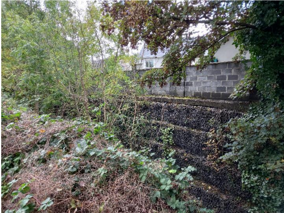
Plate 18-69 View towards gabion baskets and culverted section of Bunree stream at Moyvale Park