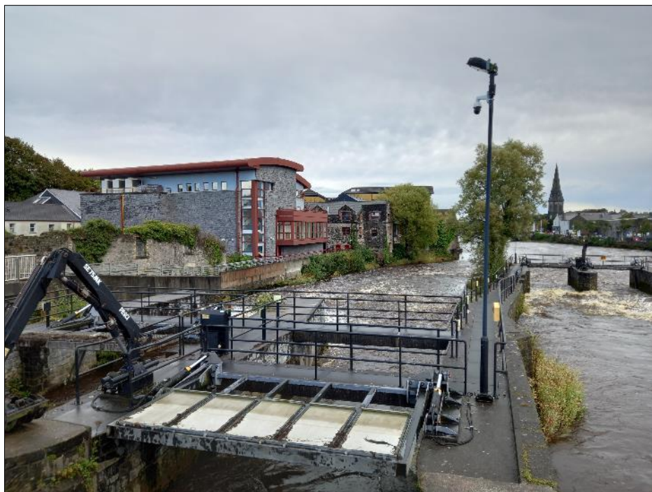
Plate 18-54 View towards Salmon Weir and rear area of Barrett Street including derelict warehouses and Ballina Arts Centre (red roof)