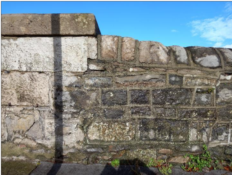
Plate 18-18 View of masonry tie-in of Upper Bridge to existing flood walling along Cathedral Road