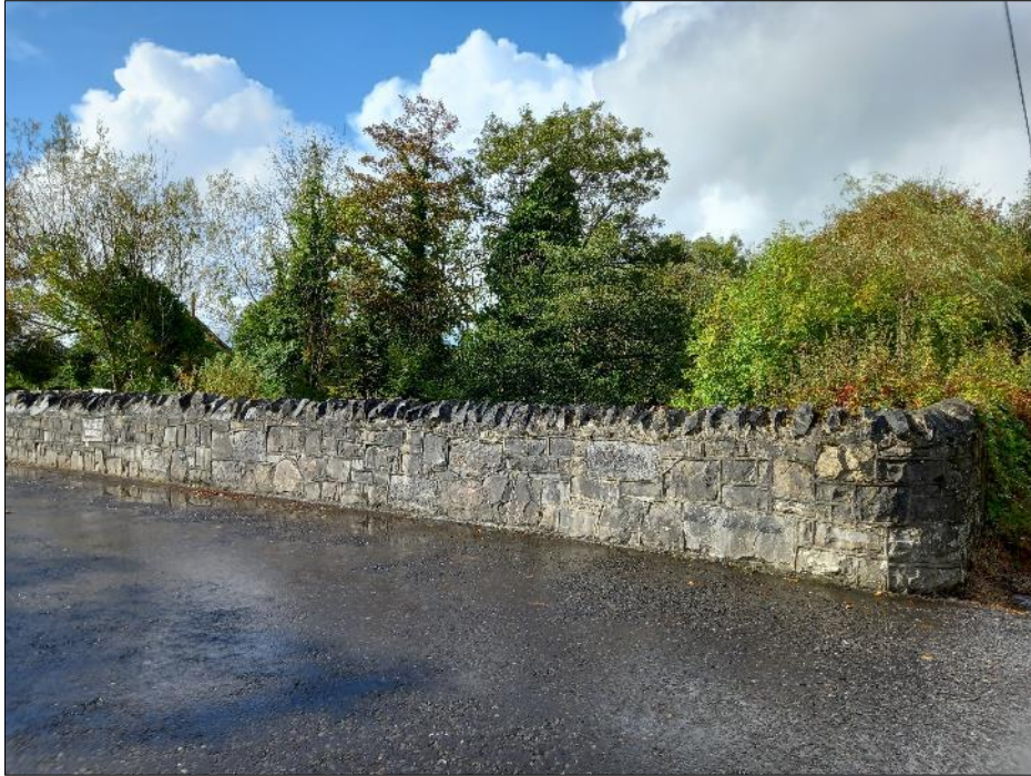
Plate 18-63 View of Rathkip Bridge (northern parapet)