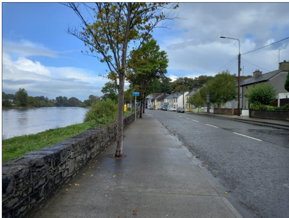
Plate 18-8 Existing flood walling along Clare Street (Howley Street)