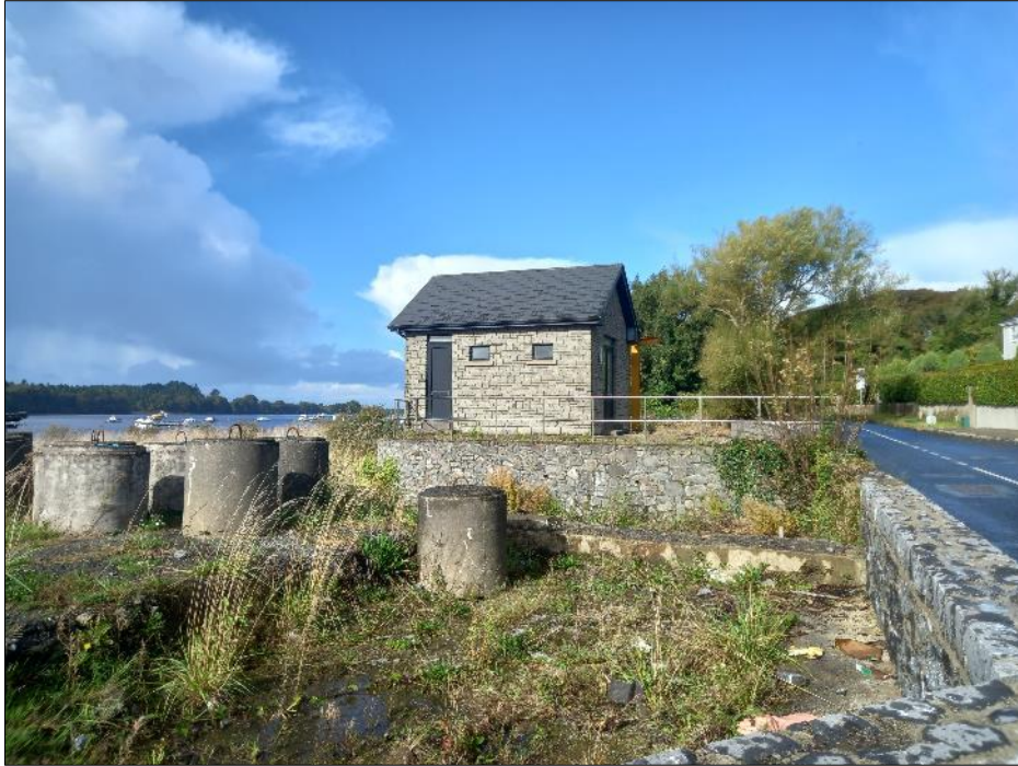
Plate 18-73 View towards north elevation Moy Boat Club building (modern) at Creggs Road/Quay Rad junction