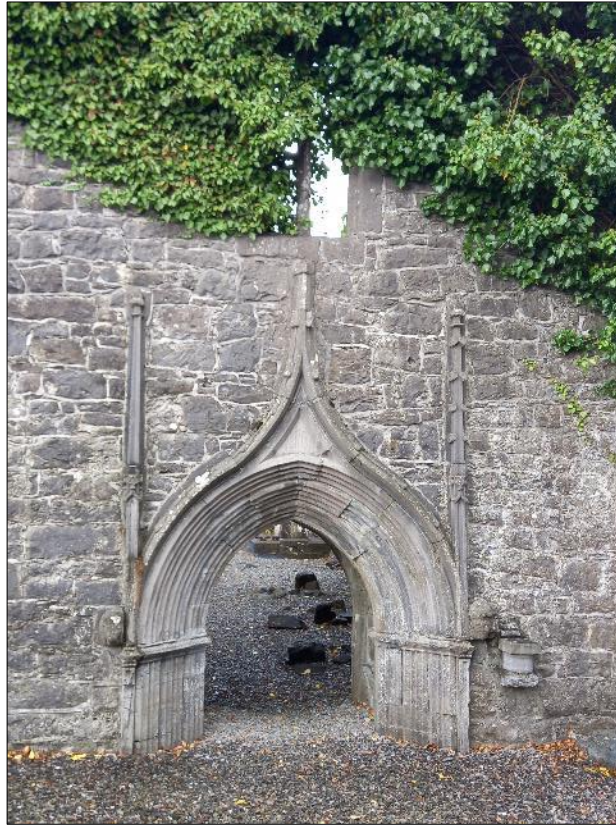
Plate 18-33 View towards elaborate west door opening of medieval Augustinian Abbey SMR MA030-074001- along Cathedral Road