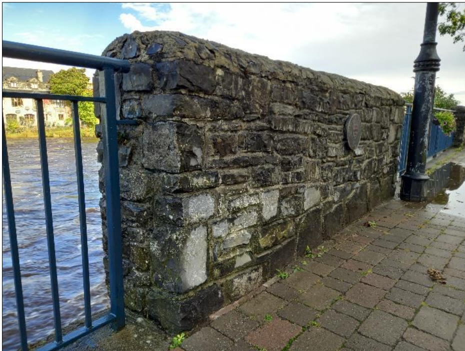
Plate 18-44 View of walling along Ridgepool Road with interspersed railings and curved coping treatment