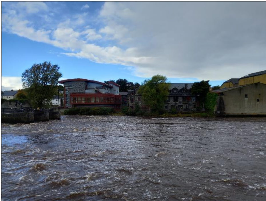
Plate 18-56 View towards river frontage area to rear of derelict warehouses and Ballina Arts centre requiring replacement flood walling