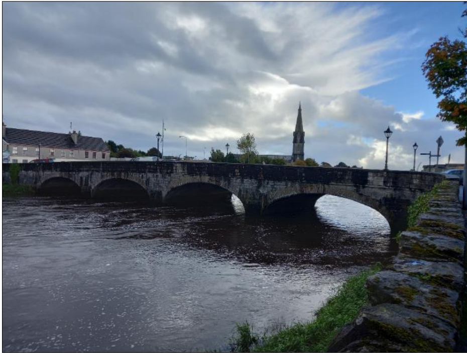
Plate 18-3 View towards northern elevation of Lower Bridge along Bachelor's Walk