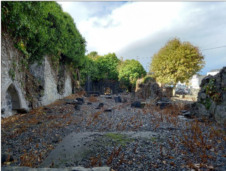
Plate 18-32 View towards interior area of medieval Augustinian Abbey SMR MA030-074001- along Cathedral Road