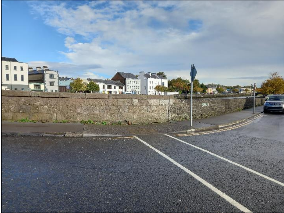
Plate 18-17 View of junction between Upper Bridge curving wing wall and Cathedral Road existing flood walling