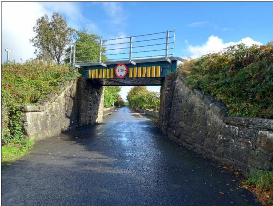
Plate 18-64 View of railway bridge south of Tullyegan works area (in active use)