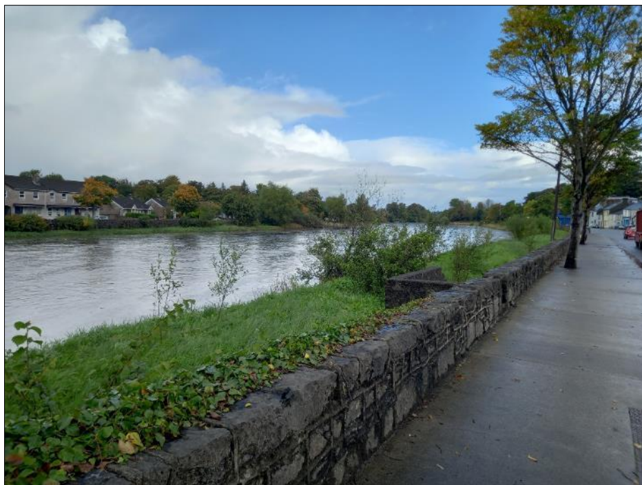
Plate 18-10 View towards north (downstream) along existing flood walling at Clare Street (Howley Street)