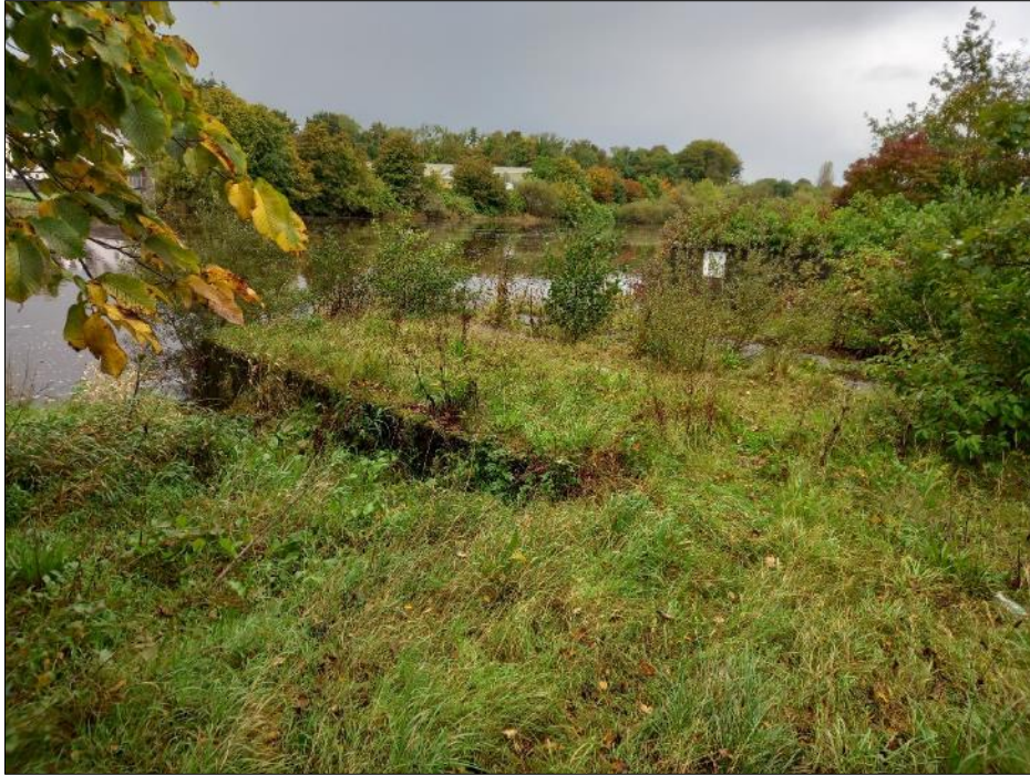
Plate 18-15 View of Pier CH03 along riverbank at Clare Street (Howley Street)