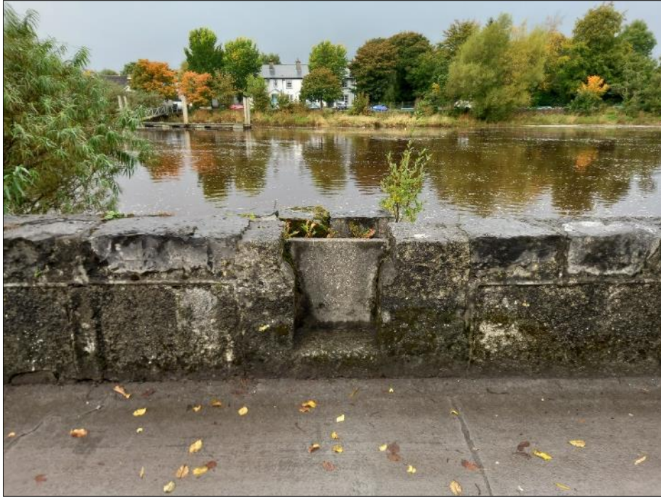
Plate 18-13 View of roadside riverbank/fishing to stone access to steps CH02 access along flood walling at Clare Street (Howley Street)